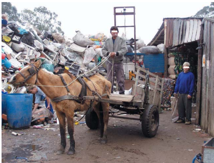
Figure 3 A ragpicker, on his horse-drawn cart. He has brought material to a collection point, where a middle man will weigh his material, and pay him cash for it.

rate. Sometimes, they may be paid in food products in addition to cash.