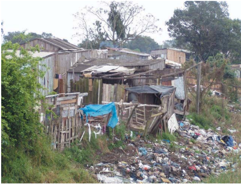
Figure 1 Houses of ragpickers are often of very poor condition. They bring garbage back to the house to separate it, and there are often piles of non-recyclable waste dumped nearby.

Almost half (47%) of the ragpickers were non-white, compared to 32% of non-ragpickers, and only 15% of the Pelotas general population. Although we attempted to match non-ragpickers to ragpickers to within one year of schooling, the differences were so marked that our samples retained some striking differences in education. Fully 22% of ragpickers had not completed a single year of schooling, while only 12% of the non-ragpicker sample had no schooling. In the general population sample, only 1% reported less than one year of schooling (table 1).