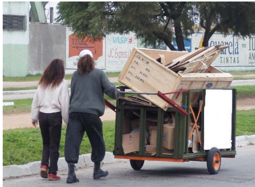
Figure 2 Ragpickers at work in the streets of Pelotas. Pushcarts are commonly used to collect and transport waste.

Recyclable materials are transported from the ragpickers' households to local "middle man" businesses that purchase recycled products ( sucateiros in Portuguese) (fig 3). The ragpickers bring their collections to these businesses for weighing; and they are paid directly in cash, on the basis of the current market